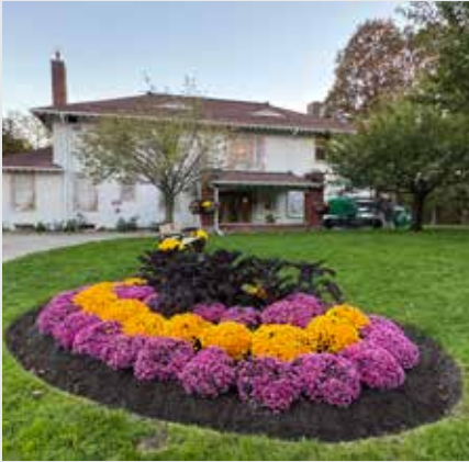
Cedar Ridge located at 225 Confederation Dr. in Scarborough-Woburn.

Cedar Ridge Creative Centre occupies an estate whose roots reach back to 1844, when the land was first patented to James Humphrey. After changing hands multiple times, it was purchased by industrialist Charles Carleton Cummings, who built a 5,000-square-foot Arts-and-Crafts summer residence known as Uplands. The house's elevated setting and ravine landscape