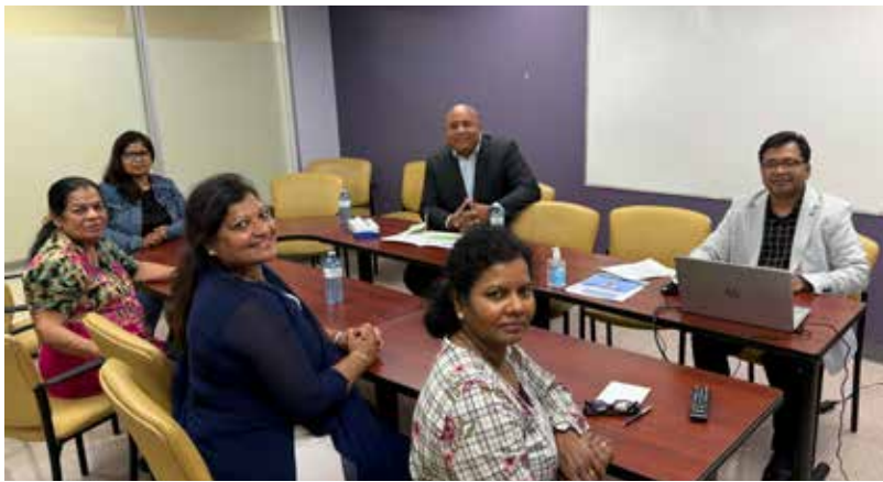
At Vasantham Tamil Wellness Centre.

I truly enjoy visiting the many organizations, schools, and community groups across Scarborough–Woburn. These visits allow me to connect directly with residents, learn about the important work happening in our neighbourhoods, and celebrate the ways our community comes together to support one another.