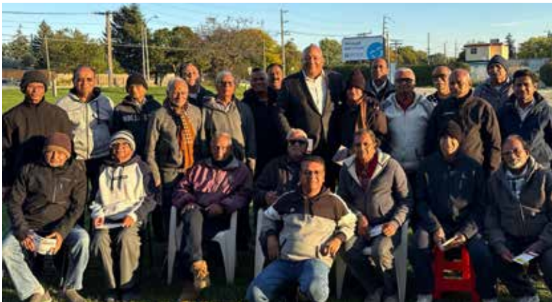
With senior residents at The Meadoway.

Seeing the dedication, creativity, and teamwork firsthand is inspiring and reminds me how strong and resilient our community truly is. Every conversation and connection reinforces how proud I am to serve such an engaged and caring riding, and motivates me to keep working alongside you to make our community even stronger.