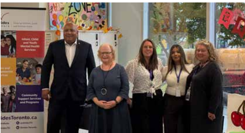
Meeting with members of Strides Toronto.